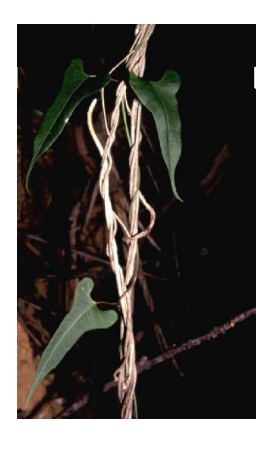
Milky Silkpod Parsonsia dorrigoensis